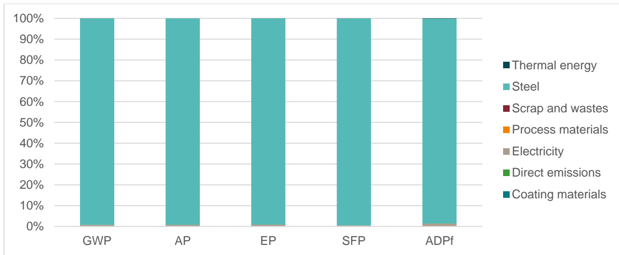
Figure 2: Relative contribution by manufacturing component for 1 metric ton of un-fabricated hollow structural sections

To better understand sources of potential environmental impacts in Searing’s manufacturing process, Figure 2 presents relative results for HSS manufacturing (A1 only). Potential environmental impacts for HSS manufacturing are dominated by upstream burdens of steelmaking.